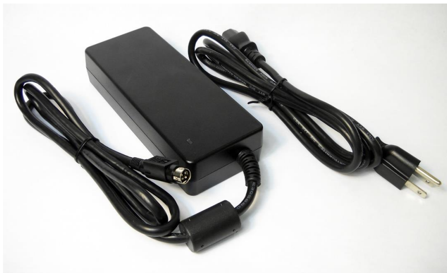
PSC PELICANLIFE BATTERY CHARGER

PSC PELICAN CHARGER: PSC offers an optional PSC Pelican LiFE battery Charger. This compact charger is rated at 7.5 Amps of charging current and will re-charge a fully depleted PSC Pelican LiFE battery in about 3 hours. Pelican LiFE Batteries that are only partly depleted will be recharged in even less time.