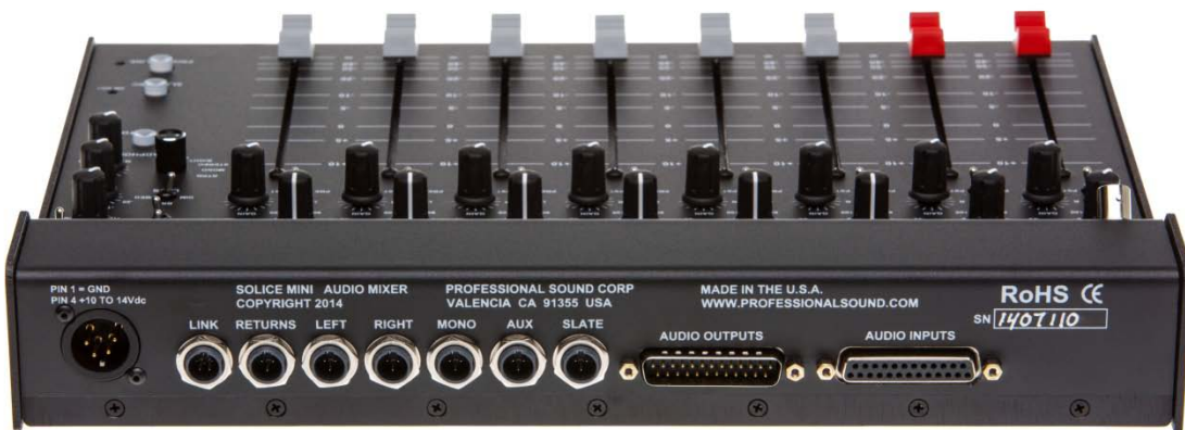
REAR PANEL VIEW