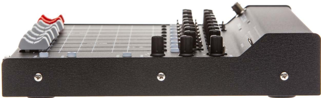
RIGHT SIDE PANEL VIEW