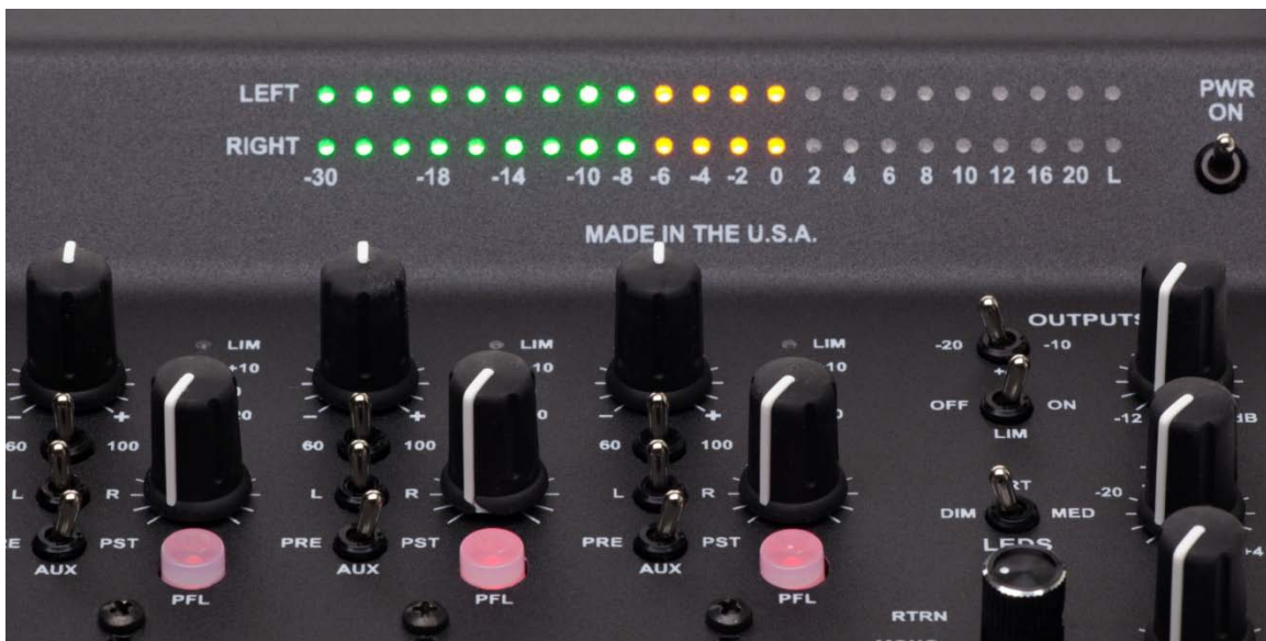
MAIN OUTPUT METERS VIEW