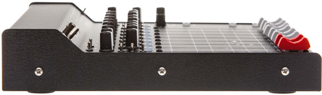
LEFT SIDE PANEL VIEW